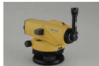
Diagonal Eyepiece DE16 (AT-B2)