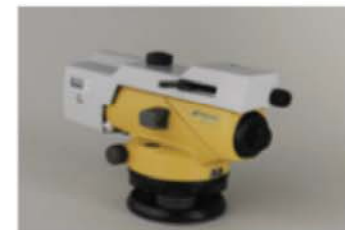
Optical Micrometer CM5 (AT-B2)