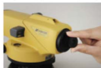
40x Eyepiece EL5 (AT-B2)