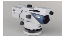
Optical Micrometer OM5 (B20)